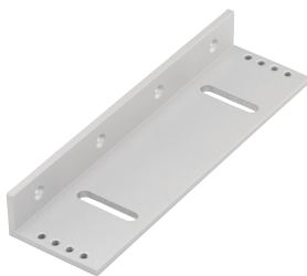
MLBK1200 - L bracket