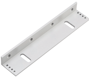
MLBK600 - L bracket