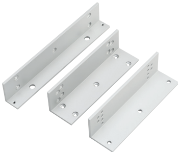
MZBK600 - Z bracket