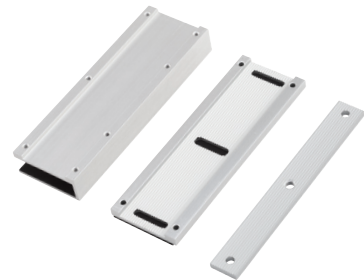
MUBK - U bracket