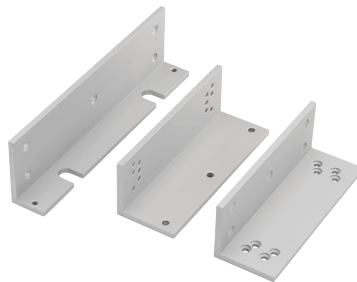
MZBK1200 - Z bracket