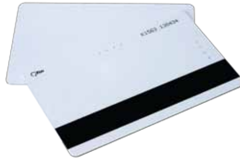
MT-10X Multi Technology Proximity Card

Keri Proximity Credentials (including Cards, Tags, and Patches) can be used interchangeably on the same system without worry about ID code duplication or format matching.