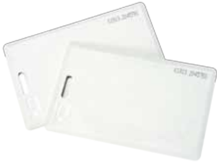
KC-10X Standard Light Proximity Card