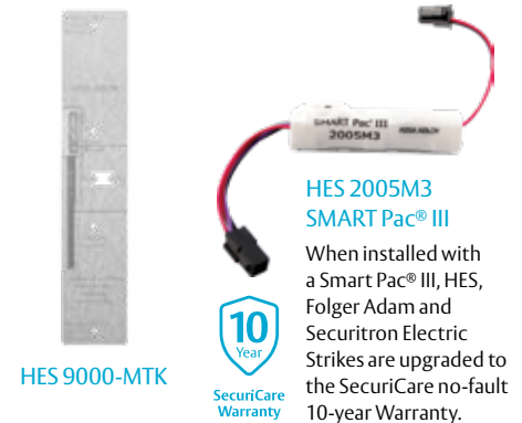
HES 2005M3 SMART Pac® III

When installed with a Smart Pac® III, HES, Folger Adam and Securitron Electric Strikes are upgraded to the SecuriCare no-fault 10-year Warranty.