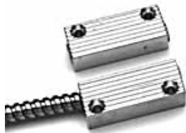
4460 Series Miniature Aluminum Commercial Switch Set