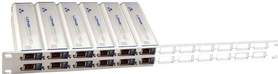
Up to 24 LONGSPAN units can be mounted in a 1U rack space.