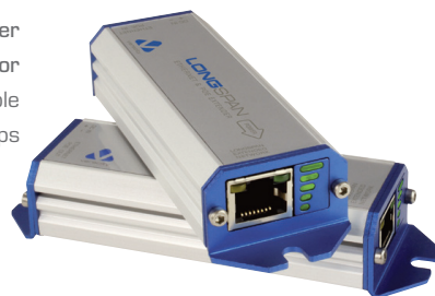
Example 2. Smart LED display shows SafeView™ technology.

NOTES: Range is for typical 24AWG Cat 5e or 23AWG Cat 6, 4-pair UTP | For other cables types, or any installations over 600 metres length, consult Veracity for recommendations or test on site | Distances may be increased by connecting multiple links in series | Datarateatfullrangestated:100Base-T=200Mbps, 10Base-T=20Mbps