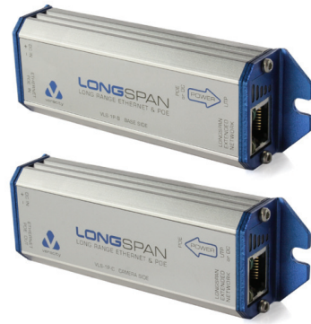
Example 1. LONGSPAN BASE and CAMERA are sold separately.

For network-only applications, the same non-POE model is fitted at each end of the link. For network and power delivery, Base and Camera POE units are used together. A POE switch or separate POE injector may be used as the Base power source. Maximum power and range is achieved with the optional 57V Veracity PSU, enabling the LONGSPAN Base unit to become the POE injector for the link.