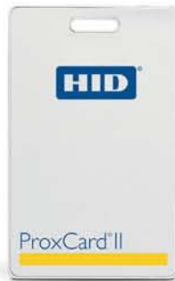
CARD - 1326