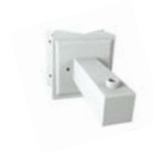
CBR Corner Mount Bracket