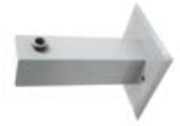
WBR Wall Mount Bracket