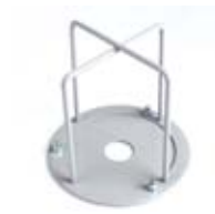
125GRD Protective Wire Guard