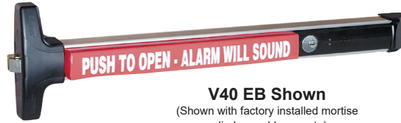
V40 EB Shown (Shown with factory installed mortise cylinder - sold separately)

The Exit Alarm with Battery (EB) option is designed for primary and secondary exits that require an alarmed panic device. The 100dB alarm will sound when someone attempts to exit, alerting management to the unauthorized exit. Available in various configurations, the EB provides security while meeting all life safety concerns, offering an exceptional value.