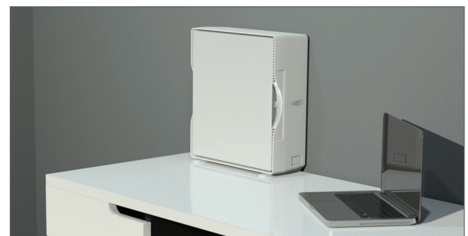
Freestanding (w/accessory feet)