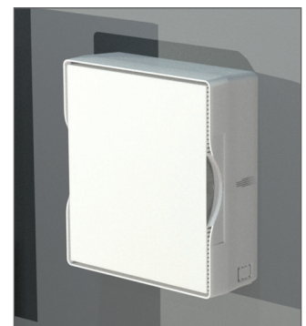
Retrofit construction (Brownfield) on-wall Installation