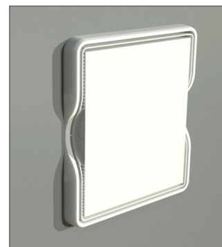
New construction (Greenfield) in-wall Installation