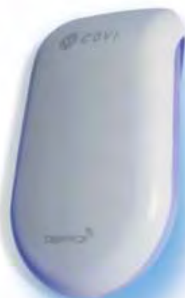
[C] WHITE VERSION: SOLARPW BLACK VERSION: SOLARPB