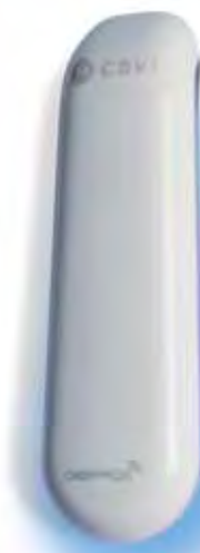
[B] WHITE VERSION: STARPW BLACK VERSION: STARPB