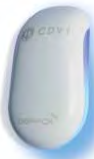
[A] WHITE VERSION: NANOPW BLACK VERSION: NANOPB