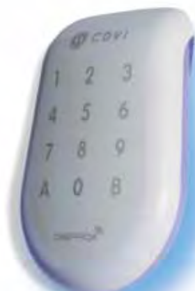
[D] WHITE VERSION: SOLARKPW BLACK VERSION: SOLARKPB