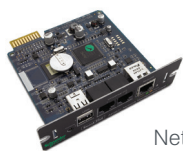
Network management card