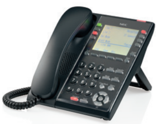
IP Handset: Easy call control from the office, remote office or home office