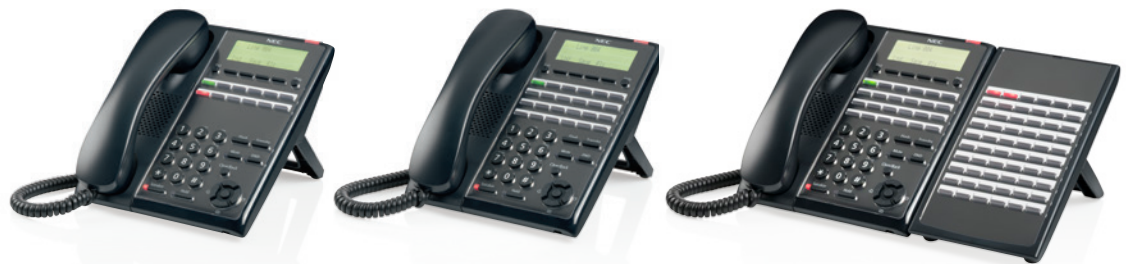
TDM Handsets: Easy call control from the office

Discover more: > SL2100 Communications System (Info Sheet)