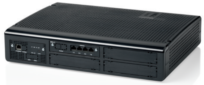
SL2100 Communication Server: Scalable from 1 to 128 users