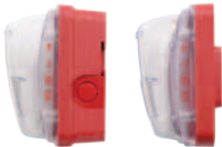
GOE and GOELP Outdoor Enclosures