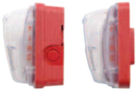
GOE and GOELP Outdoor Enclosures