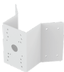
AVM-CRM-A1 CORNER MOUNT