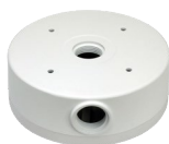
AVM-JB-BE-L1 JUNCTION BOX (WIDE VERSION)