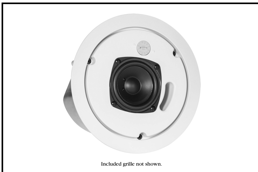
Included grille not shown.

Ideal for a wide variety of projects, the Control 12C/T is switchable for use as either an 8 ohm low-impedance speaker or as part of a 70V or 100V distributed loudspeaker system with a 15 Watt multi-tap transformer. The speaker comes complete with two tile rail supports, one C-ring support backing plate, cutout template, paint shield and grille. A safety seismic attachment ring is provided on the top surface. Available in white or black (-BK).