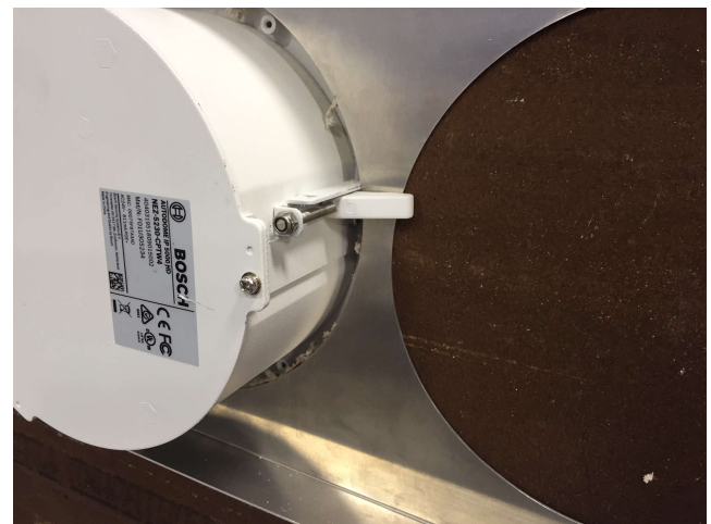
Example installation: in-ceiling AUTODOME IP 5000 HD camera clamped to MNT-ICP-ADC on top of ceiling tile