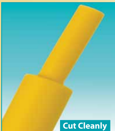
Cut Cleanly Scissor