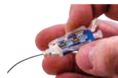
Insert and Click

Note: See color chart on page G2. For termination tools and accessories, see page G18. Cleave tool OFCLV3 suitable for multimode only. Visual Fault Locator OFVFLKT1 recommended during termination. Precision cleave tool OFCLV5 required for singlemode terminations. Use precision cleave tool for optimum performance.