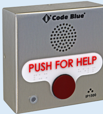
IP1500 Single button surface mounted