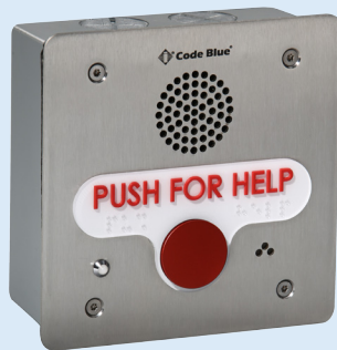
IP1501 Single button flush mounted with mounting box