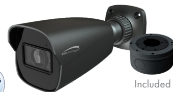
Included Junction Box