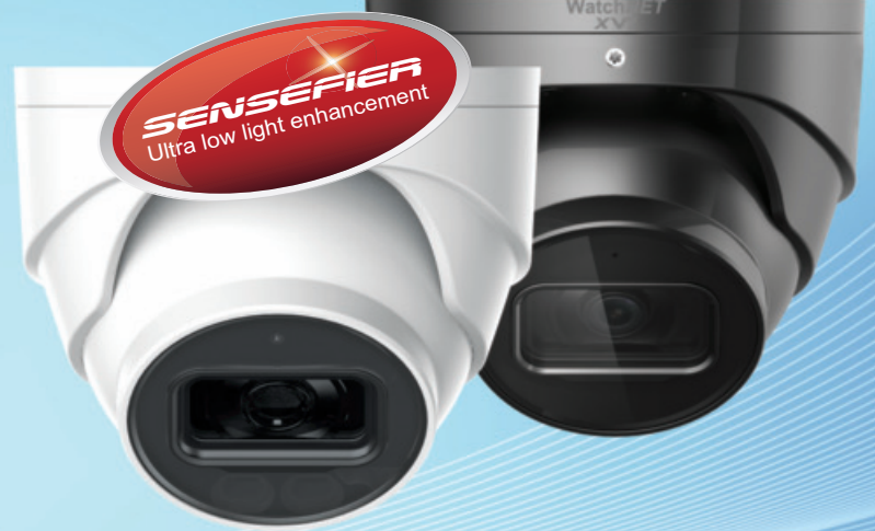
XVI-50IRBTR2 / XVI-50IRBTR2-B 5MP IR Turret Camera

XVI ENHANCED CVI MegaPixel over UTP/Coax