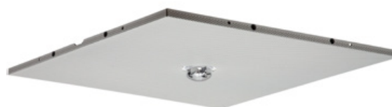
Speaker Strobe shown (as installed and close-up)