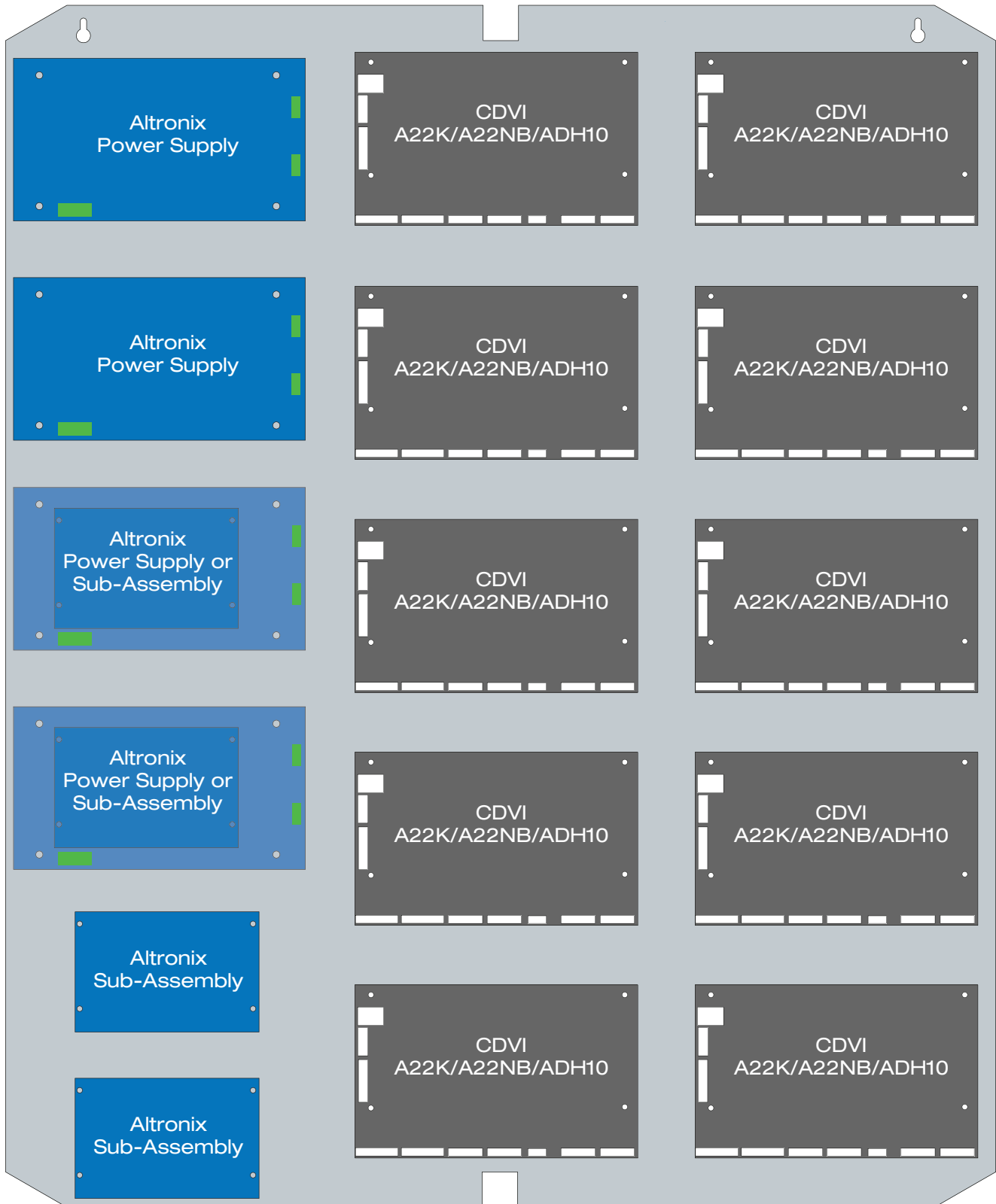
Trove3CV3 Interior Backplane - Optional Mounting Configurations

Access and Power Integration Solution for CDVI