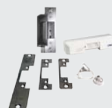
DK-1 Door Hardware Kit