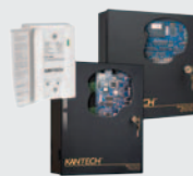
Kantech Door Controller Family