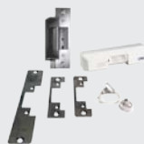
DK-1 Door Hardware Kit