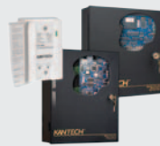
Kantech Door Controller Family