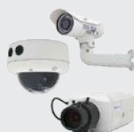
Illustra IP Cameras