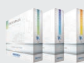
EntraPass Security Software