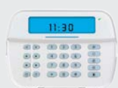
DSC Alarm Panels