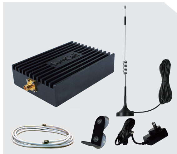
4G LTE with Suction-mount Antenna

Model SC-SOLOVI-15 for Verizon with Suction Mount Antenna