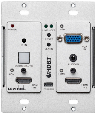
41920-HRC extender is used with the Leviton HDBaseT Receiver (41910-HTR)

Use the Leviton Autoswitching HDBaseT Extender Wallplate to connect, switch, and extend HDMI and VGA signals to displays or projectors in conference rooms, classrooms, and control centers. The wallplate inputs are automatically switched (or manually selected) to permit seamless transfer from one source to the next. It can extend signals up to 70 meters (230 feet) over a single category cable, and uses certified HDBaseT technology for a complete professional plug-and-play installation. The extender utilizes Power over HDBaseT (PoH) to provide the flexibility for powering the transmitter from the receiver at the display over category cable.