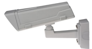
With AXIS T94R01P Conduit Back Box

AXIS T93F Series comes with a wall mount and an integrated sun cap. AXIS T94R01P Conduit Back Box, and AXIS Corridor Format Brackets are available as optional accessories to increase installation flexibility.