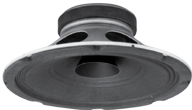
D Series (C10A Series Speaker)