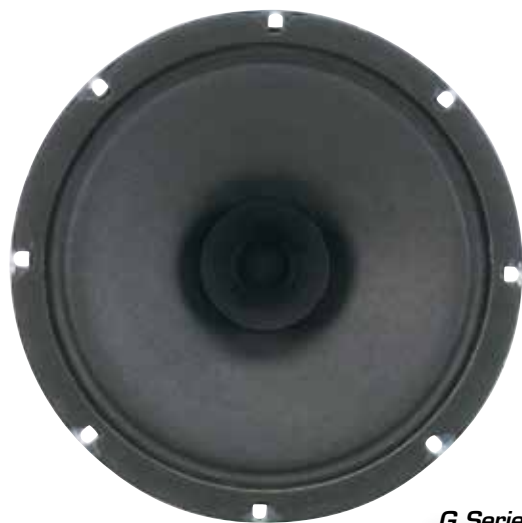
G Series (C5A Series Speaker)