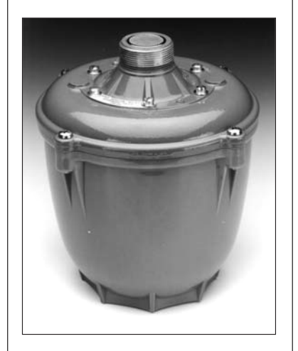
PD-60A / PD-60AT