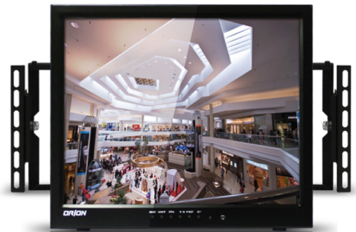
Optional RMK-08 for Rack Mount