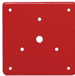
SHMP-R Adapter plate