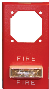
RSSP REMOTE PLATE