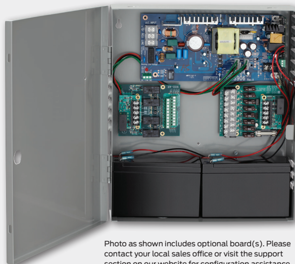
Photo as shown includes optional board(s). Please contact your local sales office or visit the support section on our website for configuration assistance.