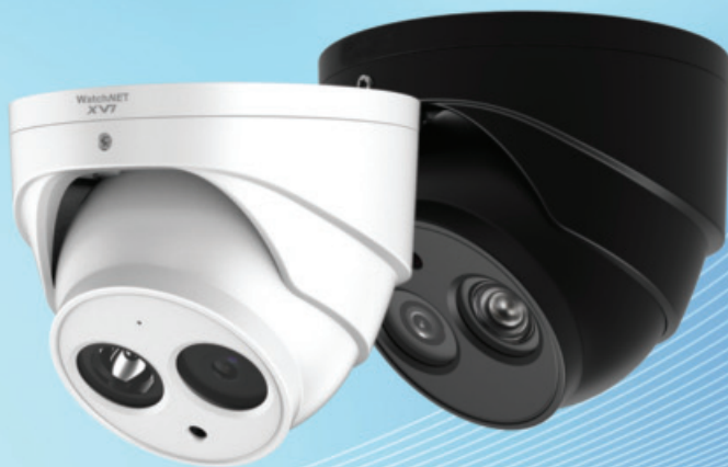
XVI-40IRBT /XVI-40IRBT-B 4MP D-WDR IR Turret Camera

XVI ENHANCED CVI MegaPixel over UTP/Coax