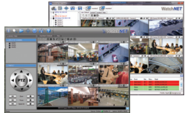
FREE Multisite VMS software included