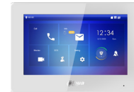
DHI-VTH5422HW Color Indoor Monitor