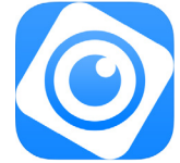
DMSS Mobile Application