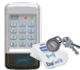
Entry Check™ 920PW