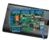
IP Pro IP-based Access Control