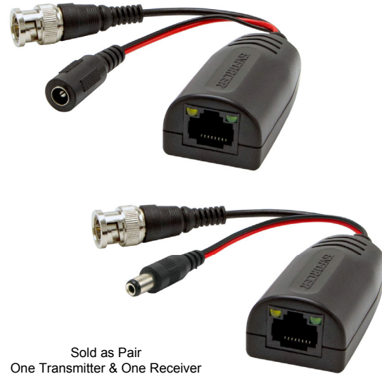
Sold as Pair One Transmitter & One Receiver