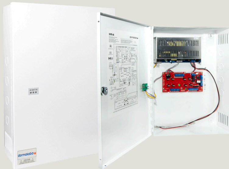
DKPS 6A Power Supply