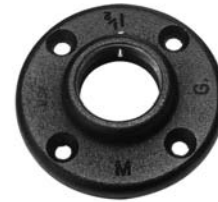
MRCA CEILING MOUNT

The MRCA is a ceiling mount designed for use with full-sphere pendant mount domes that use a suitable length of 1.5-inch NPT threaded pipe for mounting.