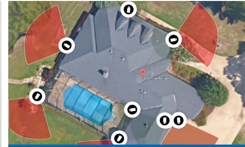
What The Central Station Sees Delivered in 5 seconds