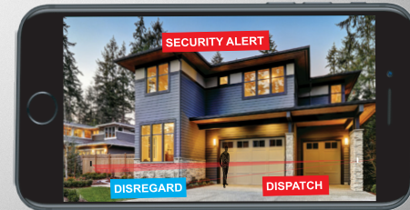
What An End-User Sees Only when/if criminal intent is detected