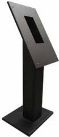
TX3-T-KIOSK2 Optional Black Pedestal