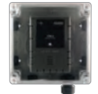
Weatherproof Housing Kit (Detector sold separately)