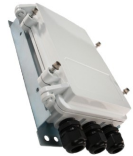
LP-2360 - EXTERNAL

The LAN-Power LP-2340 and LP-2360 PoE and Ethernet Data Segment Extenders enable the extension of both Power over Ethernet (PoE) and Ethernet Data, over standard CAT 5 (or above) cabling, beyond the specified 328 feet (100 meter) lengths for 10/100Base T Networks. They forward both PoE Power and Ethernet Data for one additional 328 feet (100 meter) segment per installed unit. Multiple units can be installed in series for longer distance applications, with no degradation in network speed or added latency. The LP-2340 is designed for internal applications and the LP-2360 , with its weather-resistant enclosure (IP 67 Rated), is designed for external applications. The LP-2360 includes back plate mounting bracket and three (3) external wiring grommets.