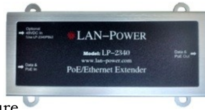
LP-2340 - INTERNAL