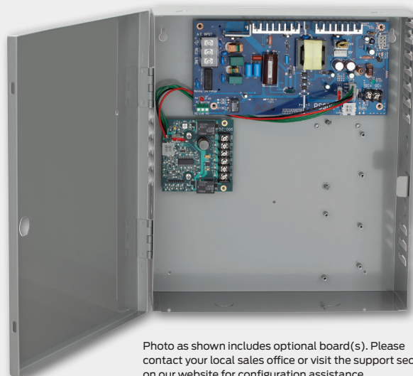
Photo as shown includes optional board(s). Please contact your local sales office or visit the support section on our website for configuration assistance.