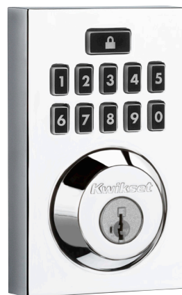
99140-020 Polished Chrome 26

FINISH AND LIFETIME WARRANTY MECHANICAL ONE YEAR ELECTRONIC WARRANTY