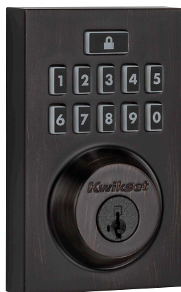
99140-020 Venetian Bronze 11P