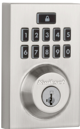
99140-019 Satin Nickel 15