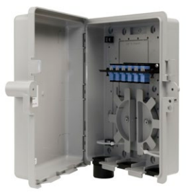
NEMA 3 Enclosure