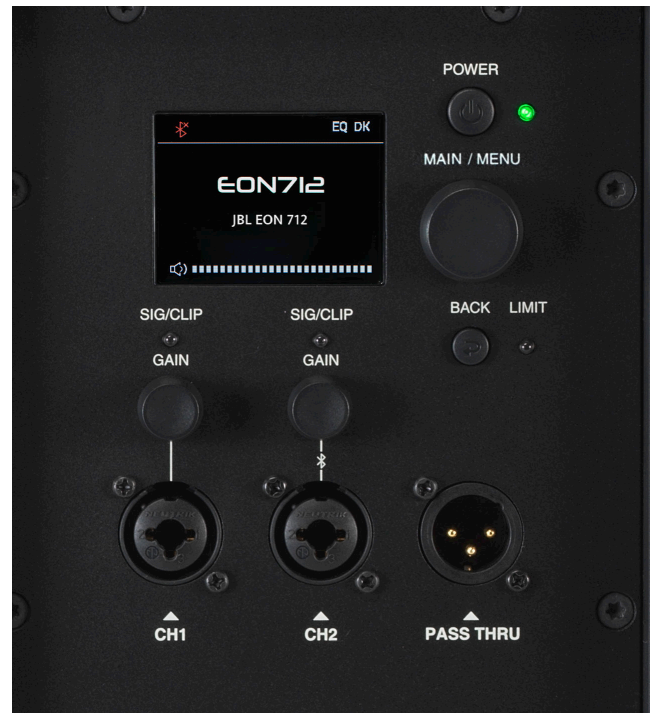
REAR PANEL CONNECTIONS

The JBL EON712 12-inch loudspeaker, part of JBL's new EON700 Series of powered PAs, brings advanced DSP and control to portable systems for live sound and installed applications, with class-leading volume and clarity and comprehensive features that make setup and operation a breeze.